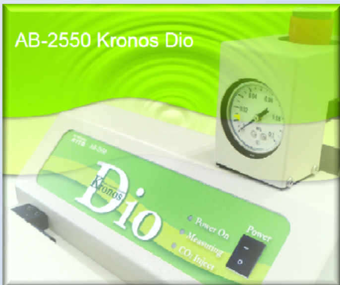
AB-2550 Kronos Dio

AB-2550 Kronos Dio is a luminescence measurement device (luminometer) that equips a photomultiplier tube as a detector. This device is suitable to monitor gene expression of culture cells and cultured tissue slice at fixed intervals over a period of several hours to several days using 35mm diameter culture dish as a sample container.